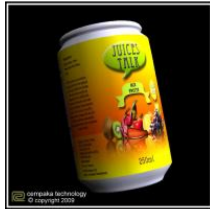
Working With Selections