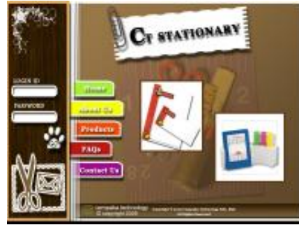
Preparing Files For The Web