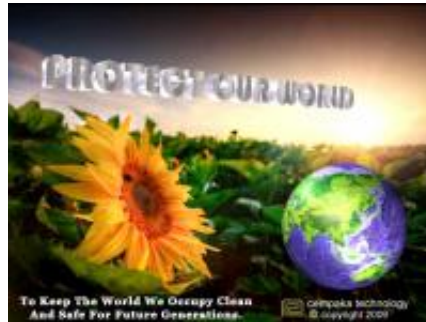
Working With 3D Images