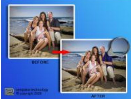
Basic Photo Corrections