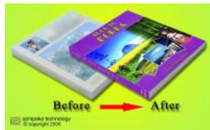
Masks And Channels